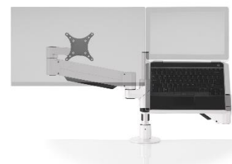
STX-500-8510 Articulating Monitor & Laptop Mount